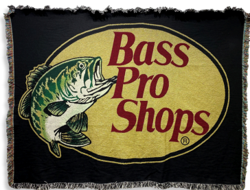
72" Custom Blanket